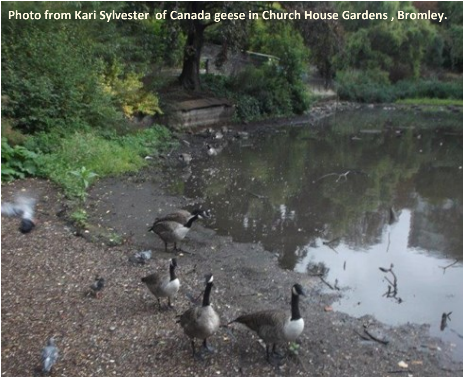
Photo from Kari Sylvester of Canada geese in Church House Gardens , Bromley.

Crowdfarming , wide selection of directly supplied products from farmers around the world, many organic: https://www.crowdfarming.com/en