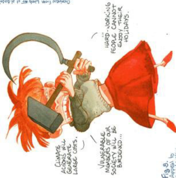
Fig. 8. Appeal to social justice

#8 IN A SERIES OF 12 CARDS: COLLECT THEM ALL.