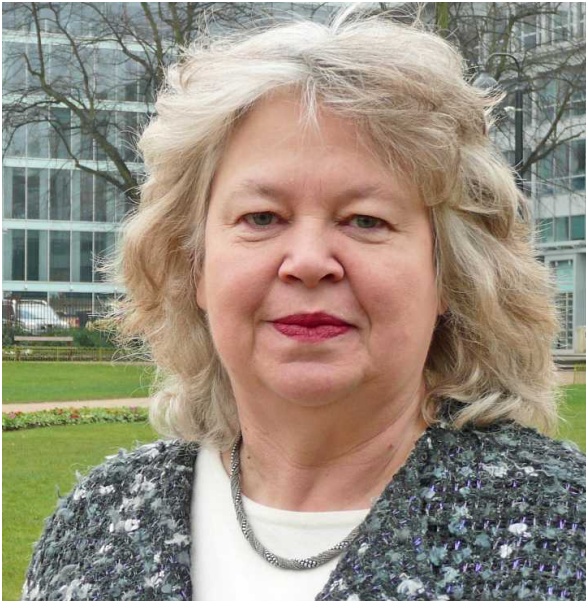
Jean Lambert MEP Guest speaker at Bromley FoE's March meeting

Jean, a former teacher, said: 'As a Londoner I am committed to making the capital an inclusive and sustainable city.'