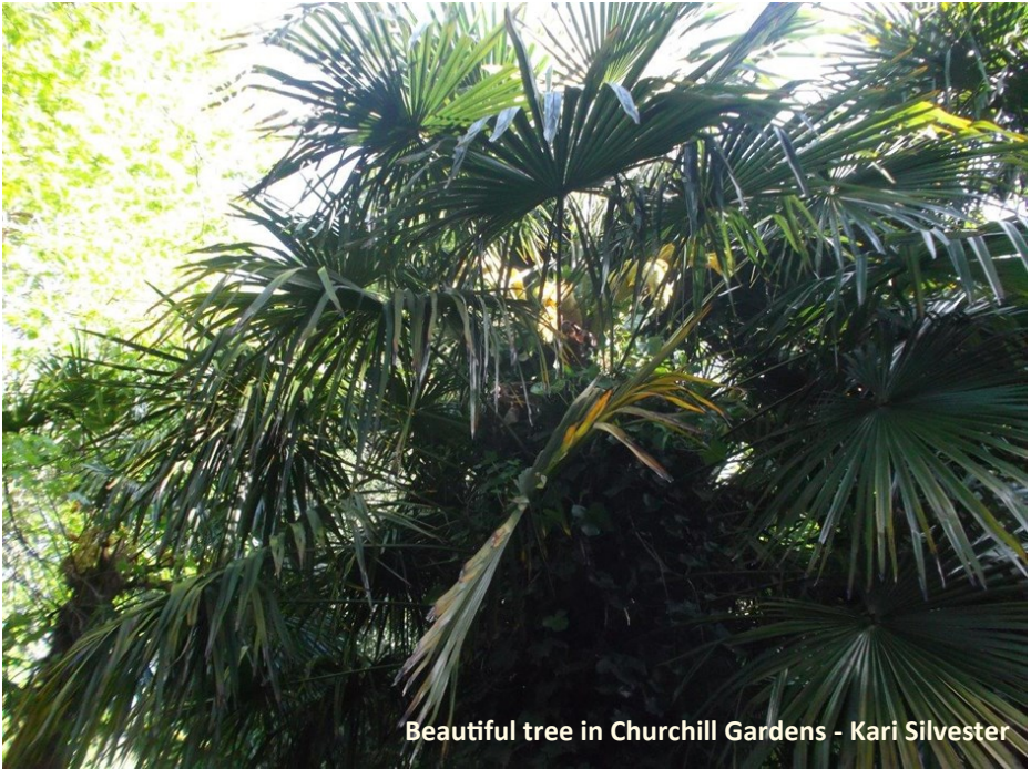
Beautiful tree in Churchill Gardens - Kari Silvester

before and after photo, or one of the flowers? Or even, sadly, if you had no success and nothing really grew!