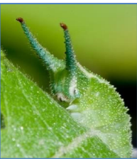
Close up of caterpillar head to show 'horns'