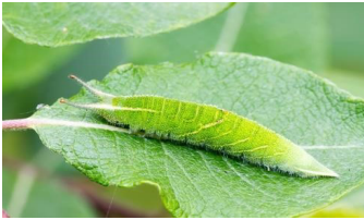
Left: Caterpillar on goat willow leaf